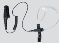
Optional Receive only earpiece with 11 pin connector EAS04