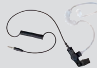
Optional Receive only earpiece with 3.5mm plug EAS05