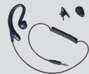
Optional C type earpiece EH-01

*: The band 320-380MHz can only use the 9cm long antenna.