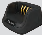
Standard Desktop Charger CH10L28